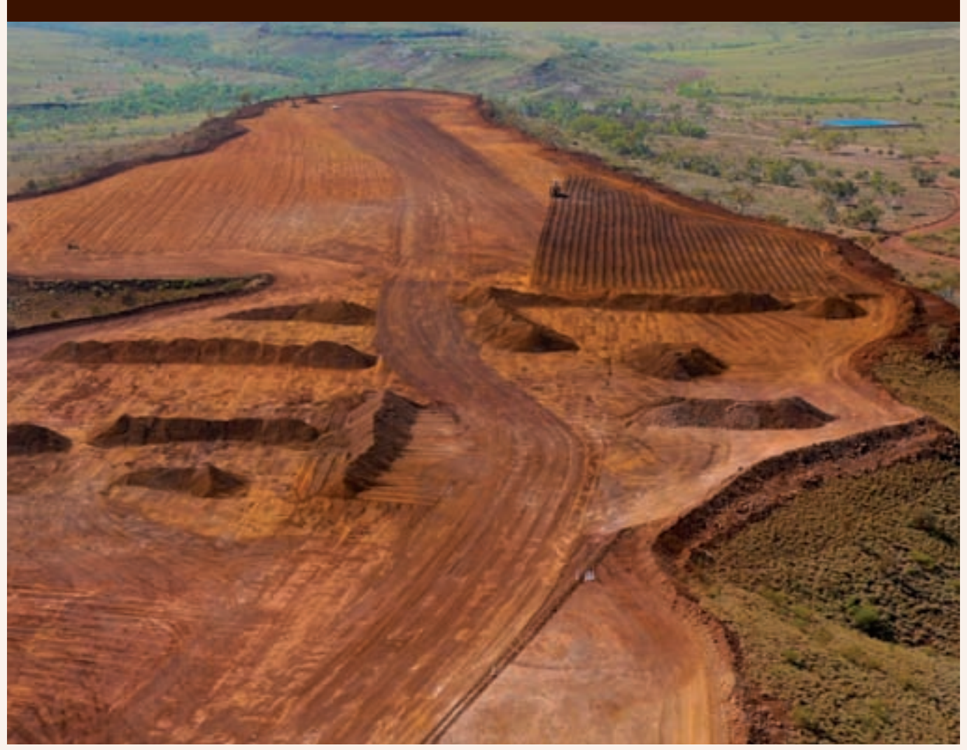
Outcamp 1 Mining Panels

In the year to June 30 2011, the NJV mined 593,452 tonnes of ore and shipped 253,158 tonnes to customers overseas.