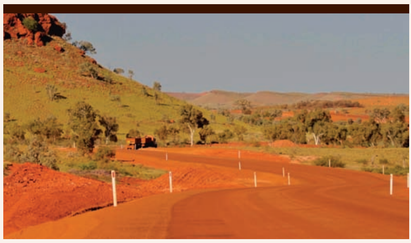
Private Haul Road Through the Chichester Range