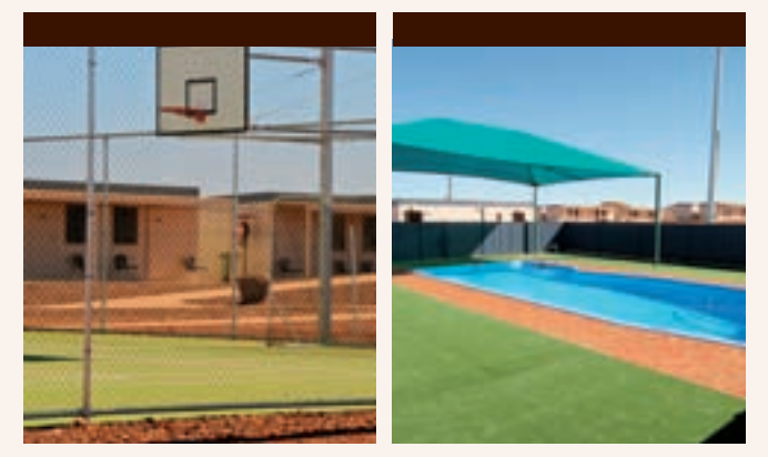
Nullagine Iron Ore Joint Venture Sports Courts, Dongas and Pool

During the year, Western Australian company Complete Portables completed the construction of a 206 man camp at the NJV which is now fully occupied. Catering and janitorial services are provided by another West Australian company, Precision Mining Camps and Services.