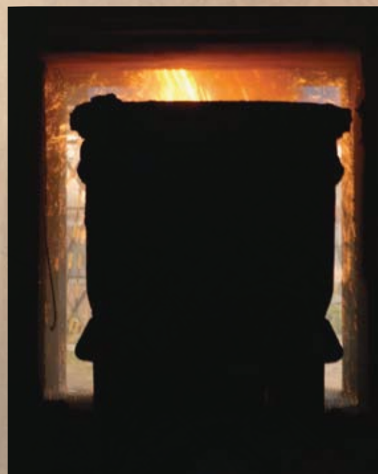
HOT IRON METAL POURING INTO LADLE, CHINESE STEEL MILL