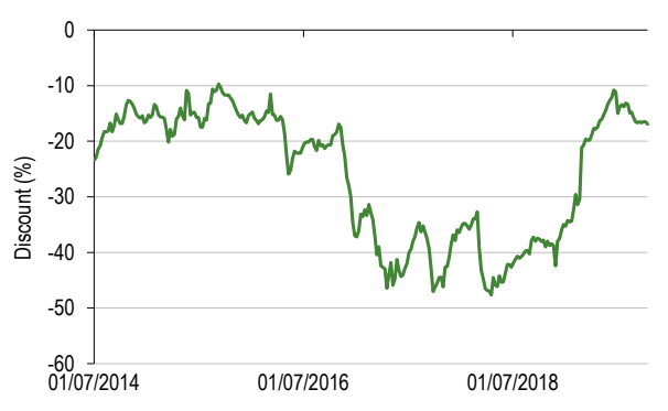
Exhibit 3: Discount of 58% iron ore price to 62% iron ore price, July 2014 to present (%)