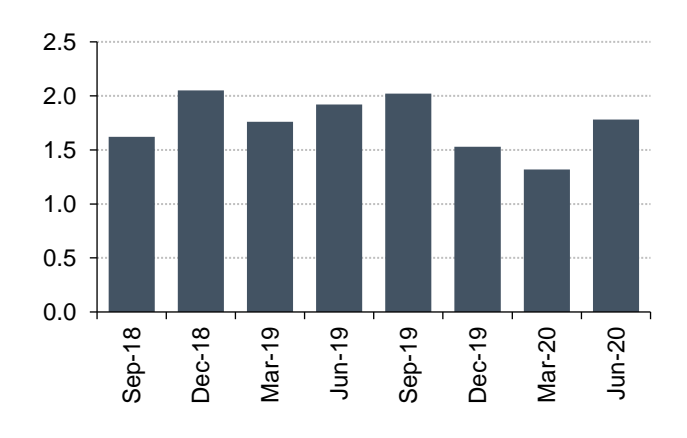
Figure 3: Iron Valley Quarterly Shipments (M wmt)