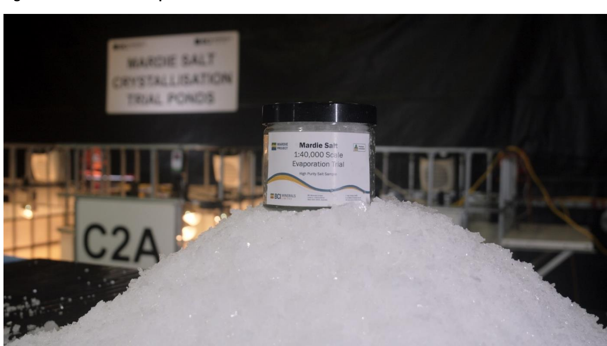
Figure 1: Mardie Salt Samples

With the DFS now complete and salt samples available, BCI will increase engagement with potential customers with the aim of progressing binding offtake agreements from late 2020 onwards.