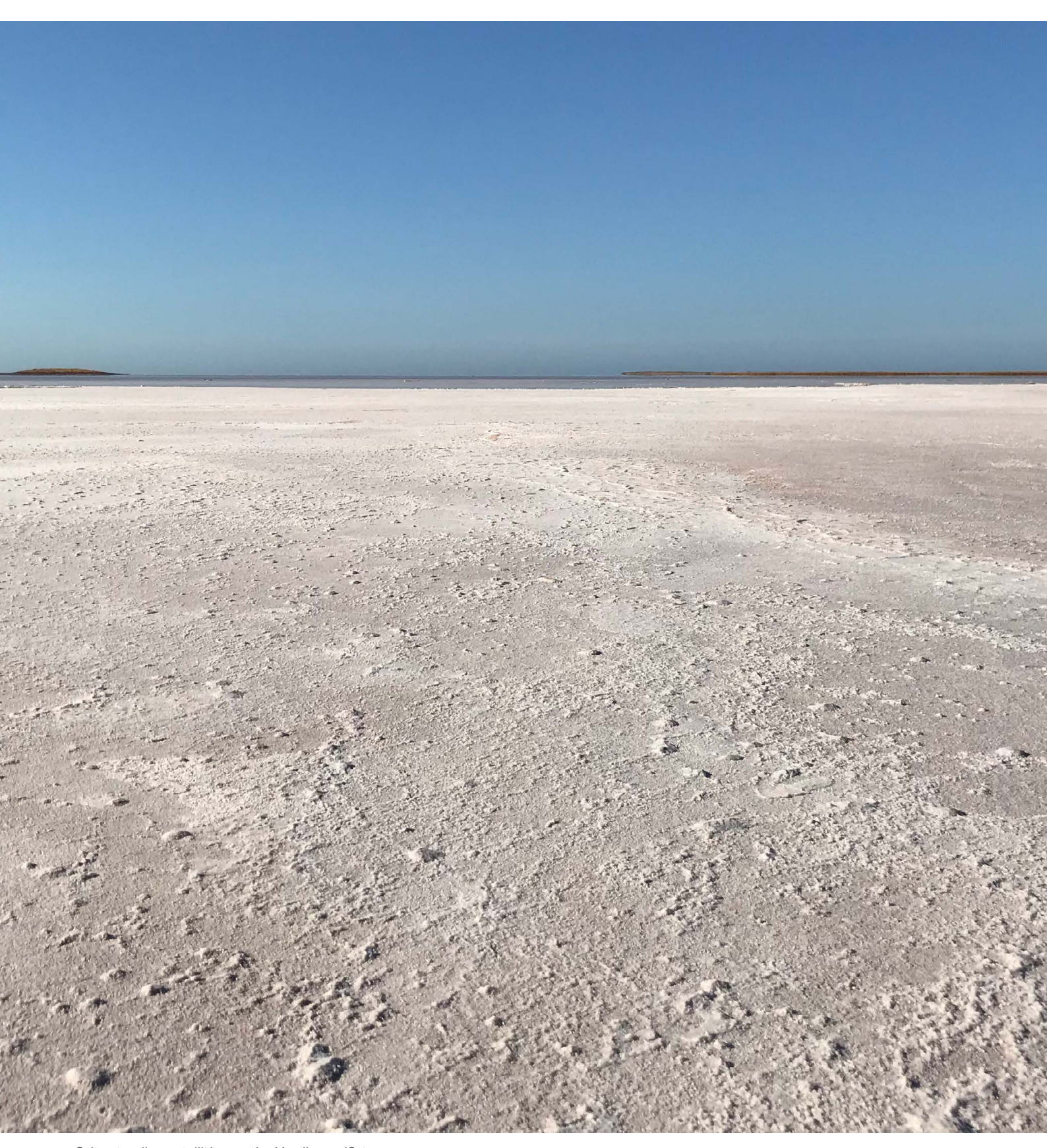
{\it Salt\ naturally\ crystallising\ on\ the\ Mardie\ mudflats}.