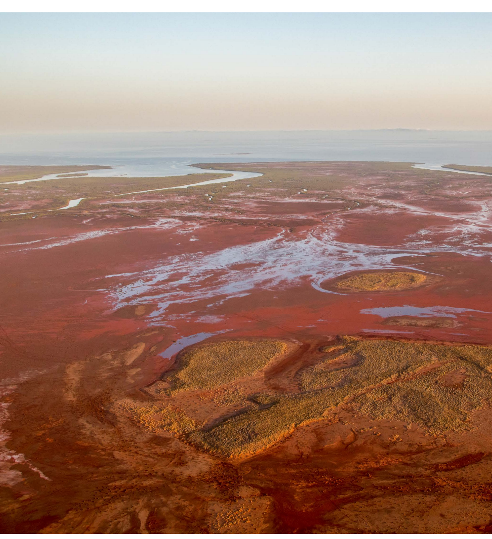
Vast area of mudflats at the Mardie Salt & Potash Project