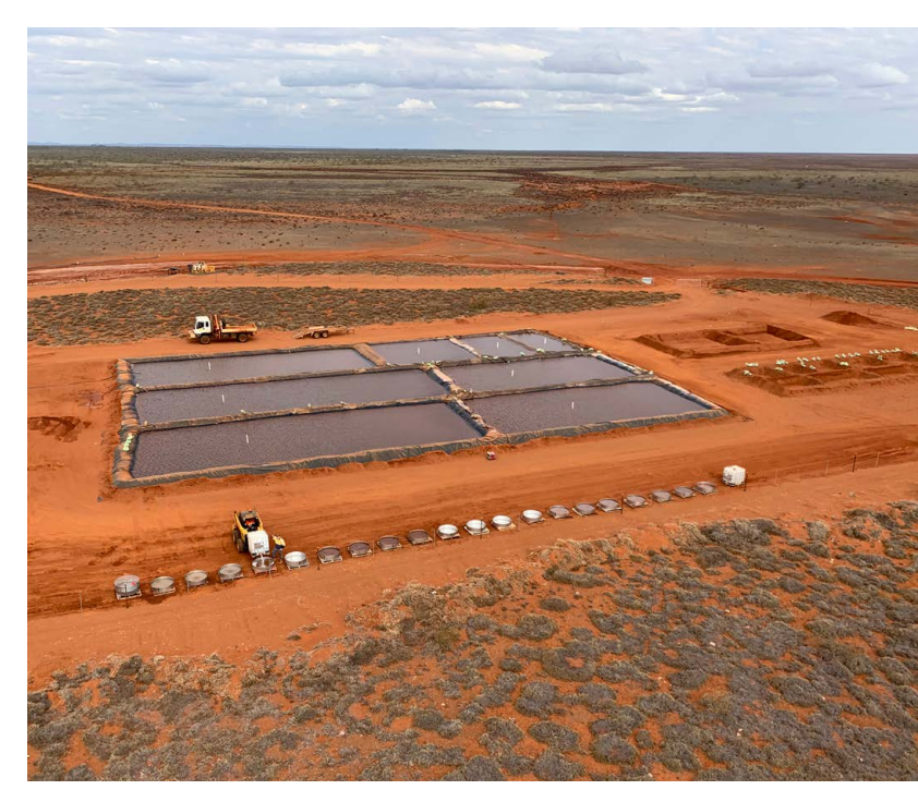
Small-scale trial ponds at the Mardie Salt & Potash Project

Site activity at Mardie has increased significantly during FY19, with small-scale trial ponds and pan evaporators constructed to conduct site specific evaporation trials and produce raw salt samples for processing test work (SOP) and customer samples (salt and SOP). First raw NaCl salts have recently begun crystallising in the trial ponds.