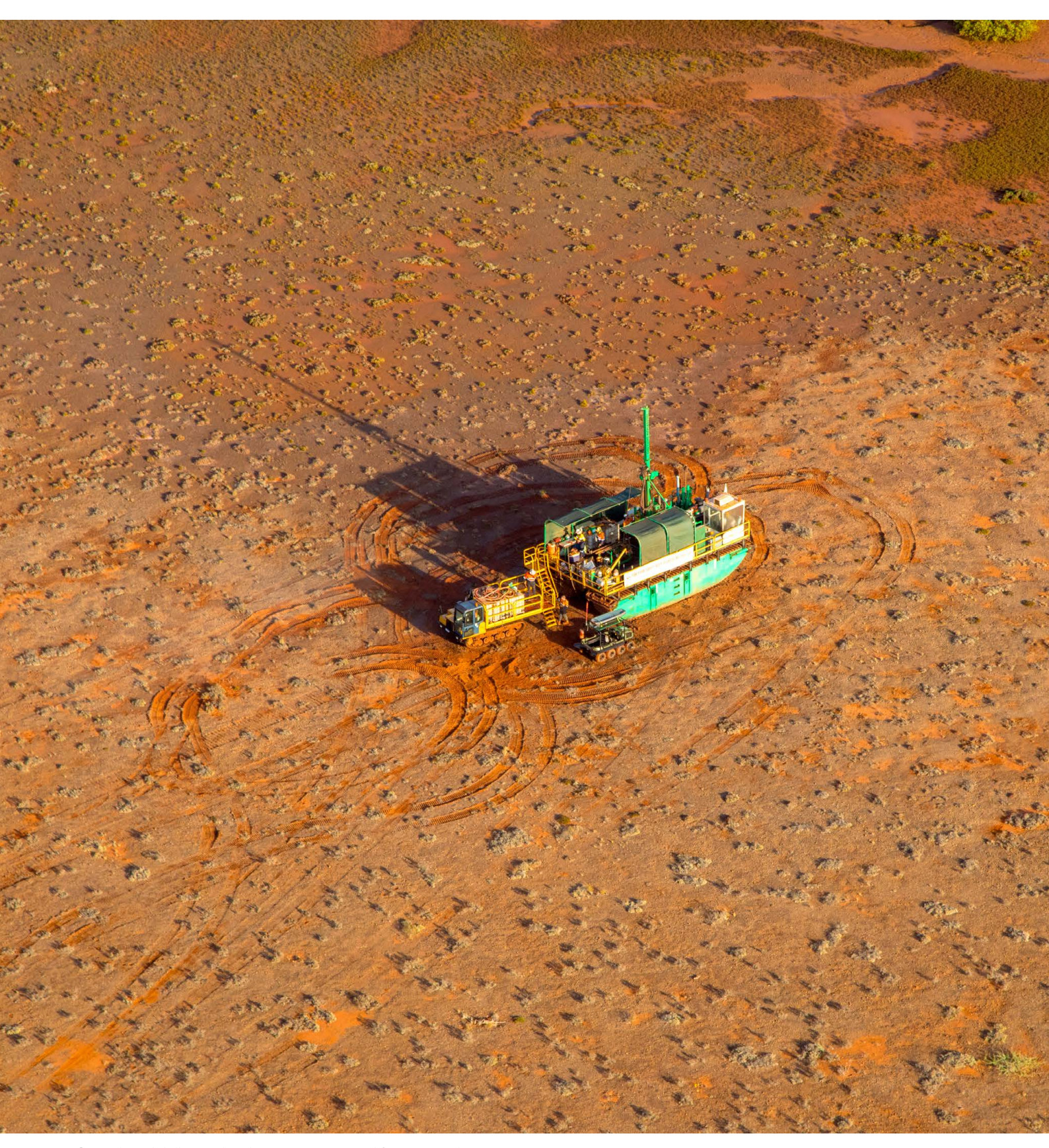
Geotechnical drilling within the evaporation pond footprint at the Mardie Salt & Potash Project